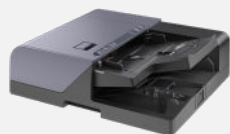
DP-7170 Dual Scan Document Processor 320-sheet capacity w/ multi-feed & staple detect 100 ipm simplex / 200 ipm duplex