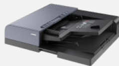
DP-7150 Reversing Auto Document Processor 140-sheet capacity 80 ipm simplex / 48 ipm duplex