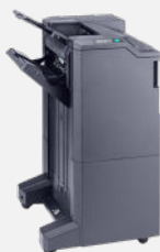
DF-791 3,000-sheet Finisher Staples up to 65-sheets