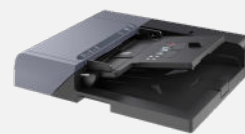
DP-7140 Reversing Auto Document Processor 50-sheet capacity 50 ipm simplex / 16 ipm duplex